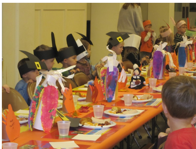
Pilgrims and Native Americans at a previous feast

cheese cubes and dried cranberries. And like the original Thanksgiving Feast--wink, wink—it will be concluded with the eating of decorated iced cookies. The important thing that they may learn is that the meal is a time to celebrate and be thankful with their (preschool) family.